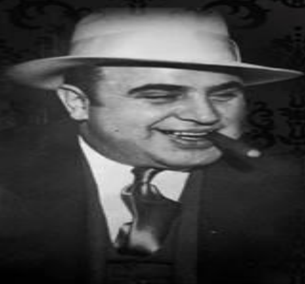
Al Capone American gangster (1899 - 1947)

You can get more with a nice word and a gun than you can with a nice word.